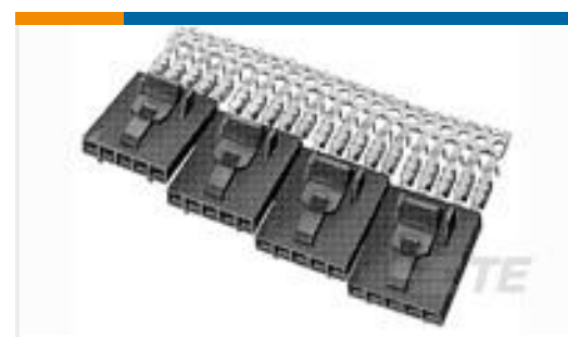
TE Part # 5-103961-5 4X6 MTE RCPT SR LATCH .100CL