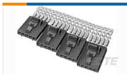
TE Part # 5-103958-5 4X6 MTE RCPT SR LATCH .100CL